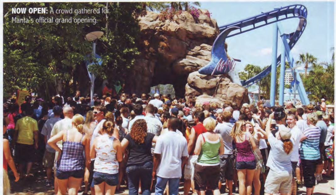
NOW OPEN: A crowd gathered for Manta's official grand opening.

From the moment you walk through SeaWorld's front gates, you'll be struck by how exhilarating, scary, yet magnetic the Manta attraction seems as it pulls you in for a ride, a walk-through, or even just a closer look. It's very cool, indeed.