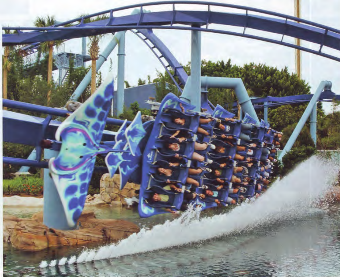
CLOSE CALL: Despite how close to the water it appears, Manta’s “wing dip” maneuver will only barely get you wet.

Overall, it’s a fairly long ride that is very smooth, without jerking its riders around. “We wanted an amazingly smooth coaster,” said