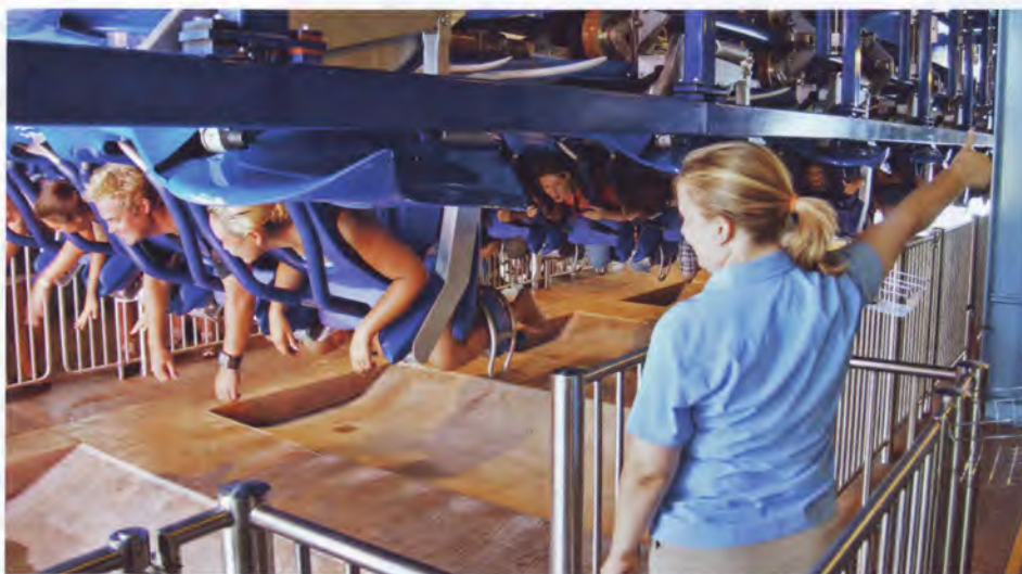
BECOME ONE WITH THE RAY: Riders load onto Manta in a standard upright position (right) but are soon after lifted backward into the flying position (above) for the duration of the ride.

As the ride starts its slow ascent up the first hill, it's an interesting feeling to be looking directly down at the guests standing (and often waving) below. As it crests the top, the cars are off and running at up to 56 miles per hour. Almost imme-