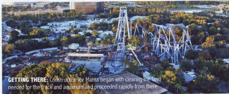
GETTING THERE: Construction for Manta began with clearing the land needed for the track and aquarium and proceeded rapidly from there.